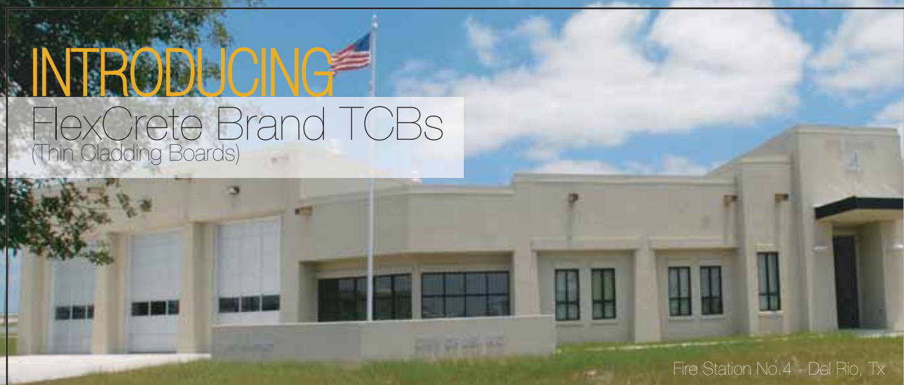
Fire Station No. 4 - Del Rio, Tx

FlexCrete Building Systems announces a revolutionary application for its 2" and 3" thick Cladding Boards (TCBs).